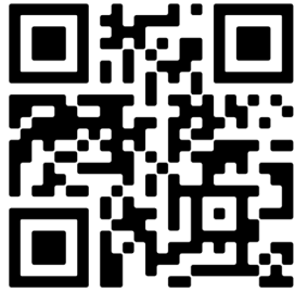
SCAN QR CODE FOR LA SALLE COLLECTION DETAILS